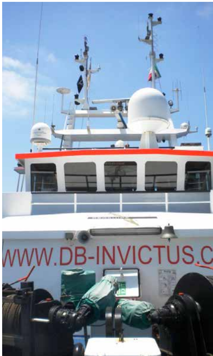
a view of the deck and crane