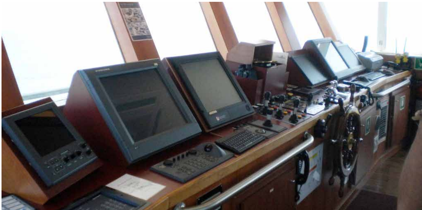
A view of the bridge