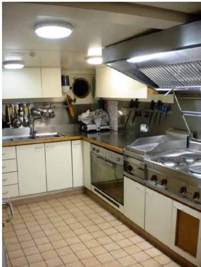
a double bed cabin and a view of the kitchen